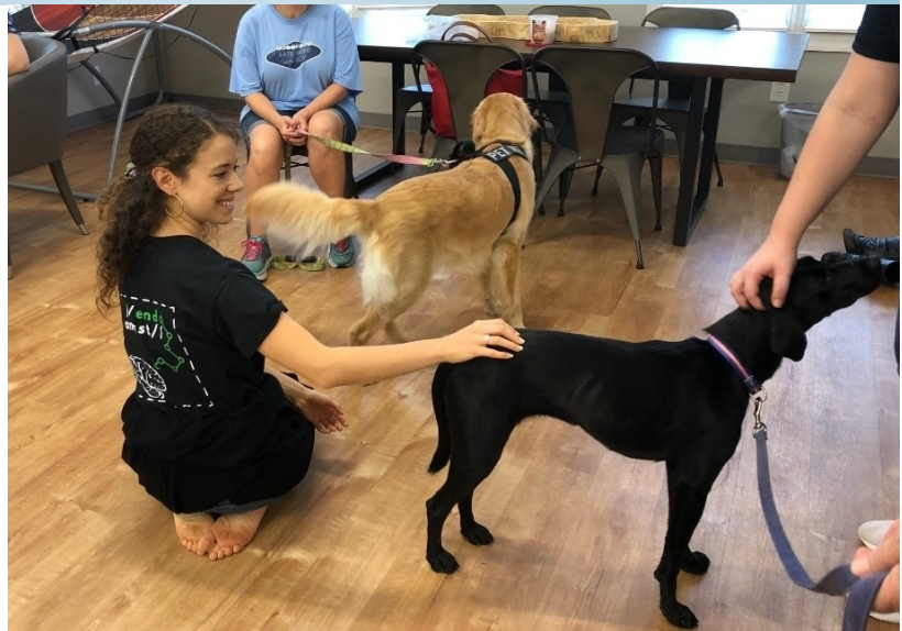
Dog therapy was part of the mental health summit

Moving forward, I will serve in 2019 as a member of the Diversity and Inclusion team for the American Society for Metabolic and Bariatric Surgery.