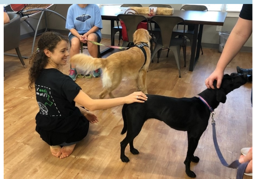
Dog therapy was part of the mental health summit

Moving forward, I will serve in 2019 as a member of the Diversity and Inclusion team for the American Society for Metabolic and Bariatric Surgery.